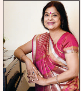
Padam Shri Malini Awasthi Ji